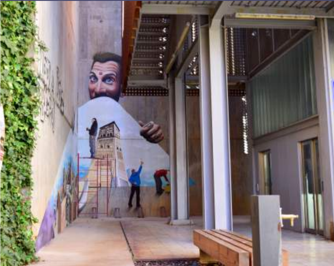
Set y Soe, 2011

In 2011 the elevator was inaugurated and the permanent commissioning of murals began