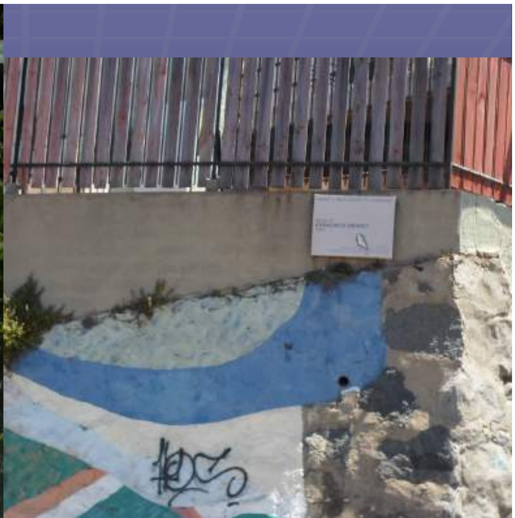
Open Air Museum, Valparaíso 1991/92