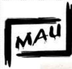
Museo d'Arte Urbana di Torino